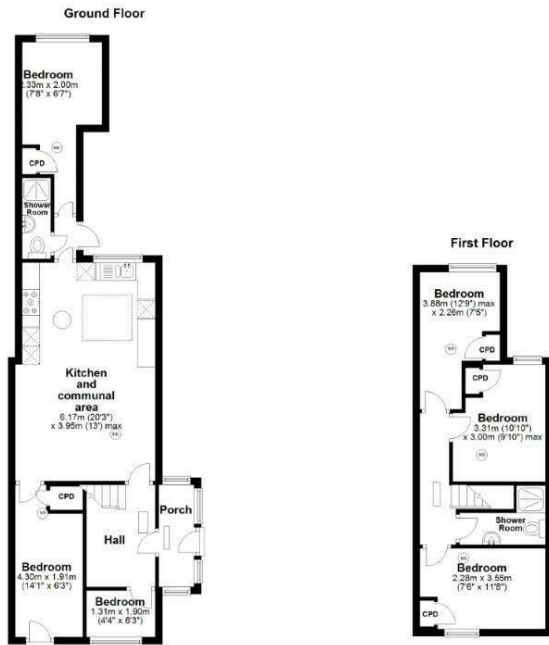
18 Katie Road, Selly Oak, Birmingham