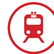
Train Harrogate 0.3 Of a mile