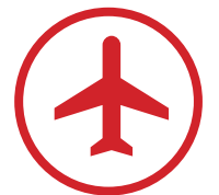
Airport Leeds Bradford 12.6 miles

Fixtures & fittings The property is being sold as seen.