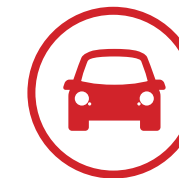
Main Roads A1M 8.1 miles