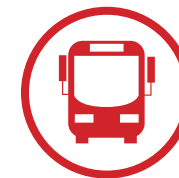
Bus 3 minutes walk