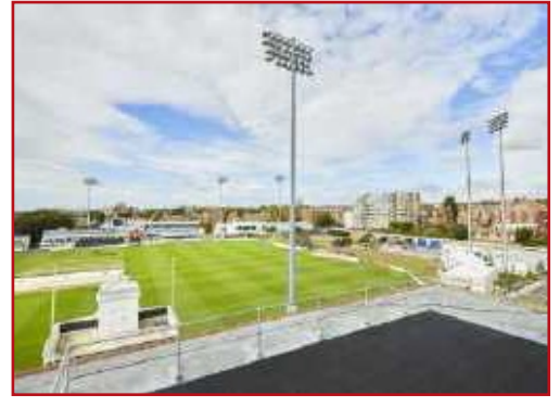
You may download, store and use the material for your own personal use and research. You may not republish, retransmit, redistribute or otherwise make the material available to any party or make the same available on any website, online service or bulletin board of your own or of any other party or make the same available in hard copy or in any other media without the website owner's express prior written consent. The website owner's copyright must remain on all reproductions of material taken from this website.