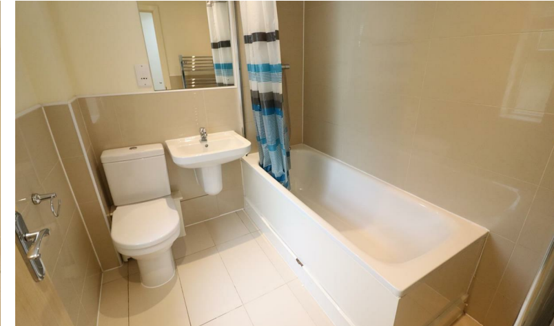
NEWBRIDGE VIEW, TRURO £950 PCM