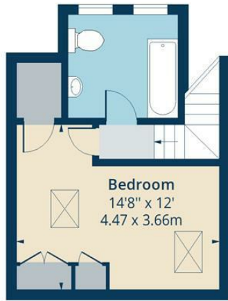
First Floor Floor Area 21 Sq Ft - 1.95 Sq M