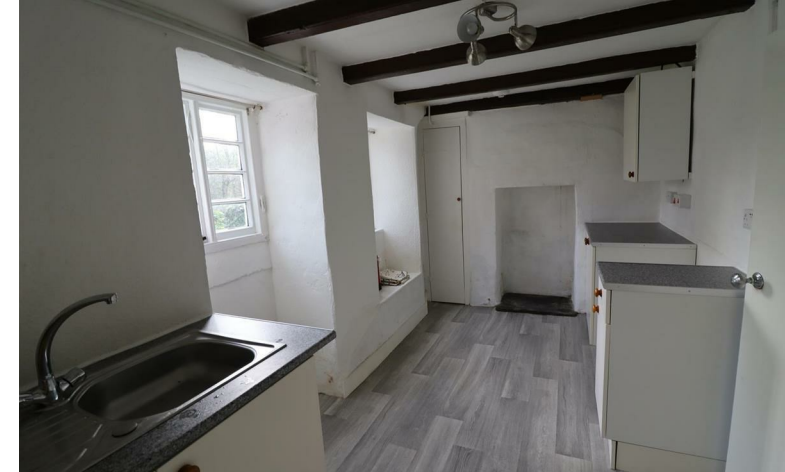
BOSILLION LANE, GRAMPOUND £975 PCM