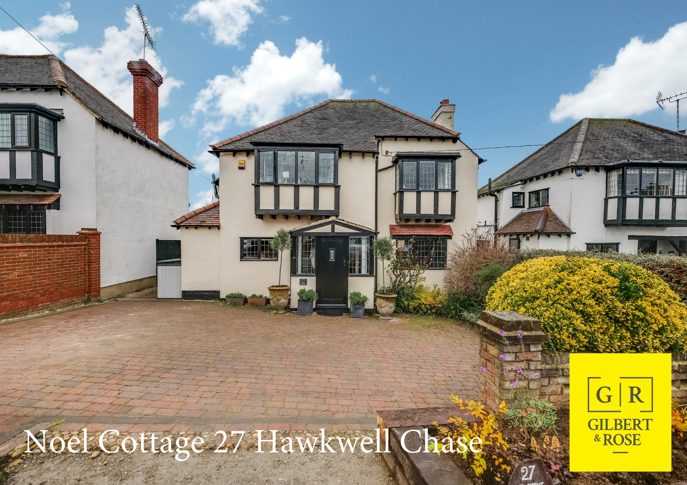
Noel Cottage 27 Hawkwell Chase