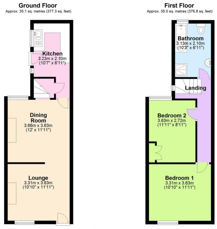
Total area: approx. 70.1 sq. metres (754.1 sq. feet) Expertly Prepared By david-mortimer.com - Not To Scale - For Identification Purposes Only Plan produced using PlanUp.