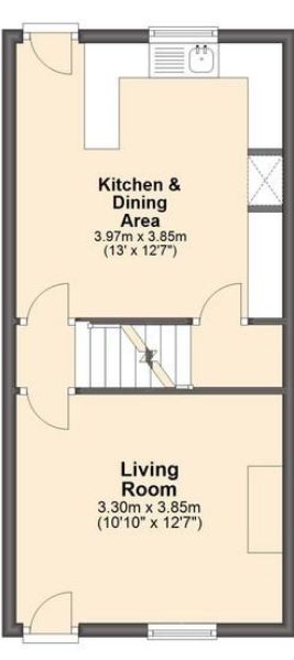
Ground Floor Approx. 32.2 sq. metres (346.6 sq. feet)