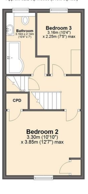
First Floor Approx. 32.2 sq. metres (346.6 sq. feet)