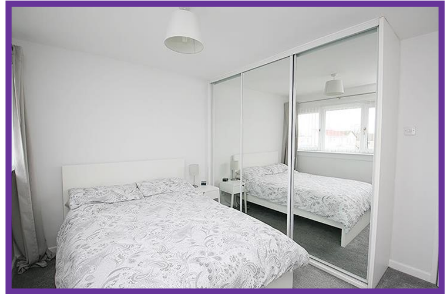
Bedroom one is a double bedroom overlooking the front aspect, with fitted mirror fronted wardrobes, fresh décor and carpet flooring.