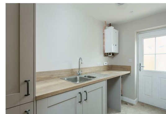
Brecks Court, Huntington, York £450,000

***LAST REMAINING PLOT*** **** FINISHED UNIT & AVAILABLE TO VIEW ****