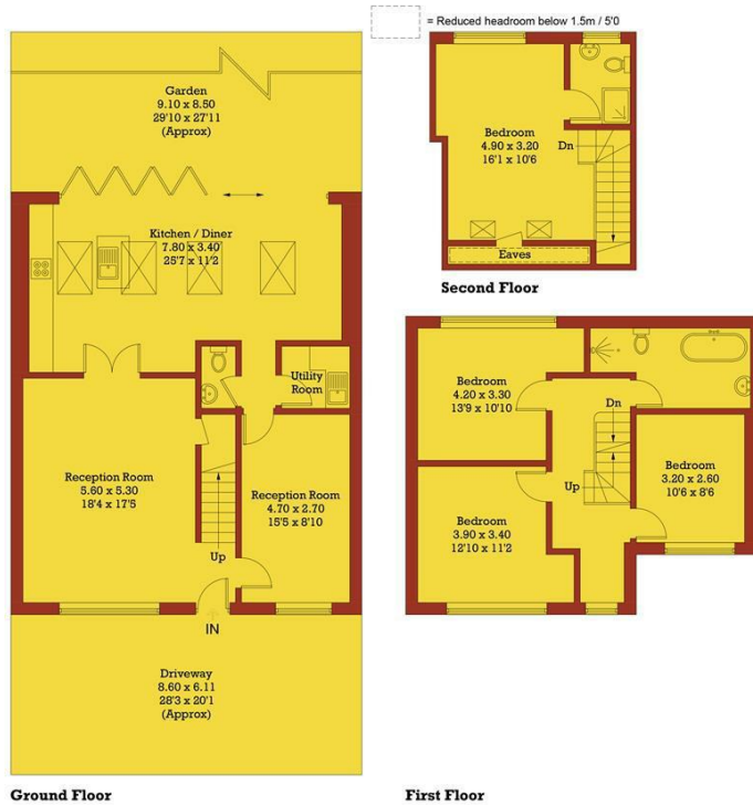
Illustration for identification purposes only, measurements are approximate, not to scale. FloorplansUsketch.com © 2020 (ID713996)