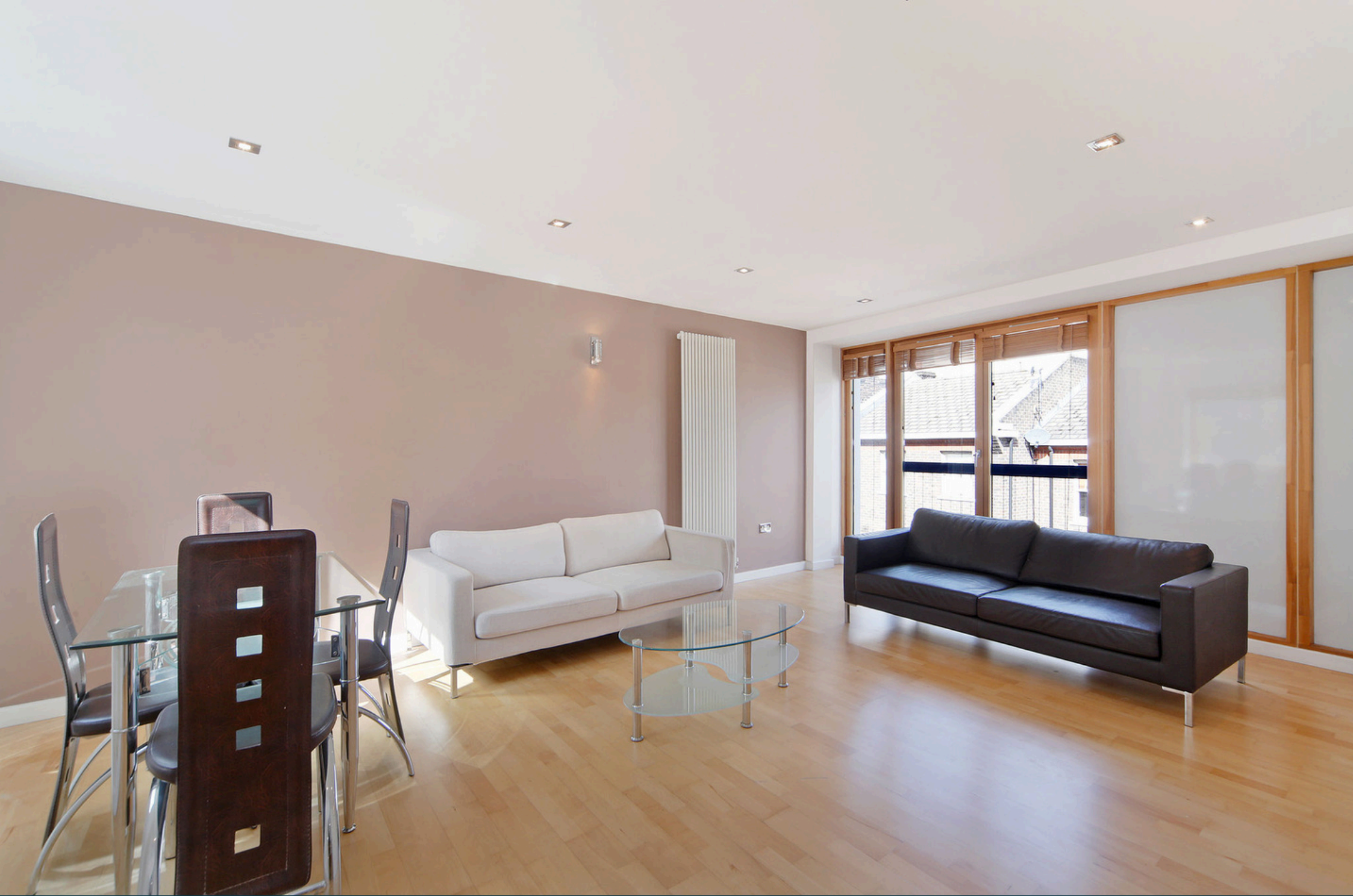
TRIBECA APARTMENTS, 12 HENEAGE STREET, LONDON, E1 5AZ