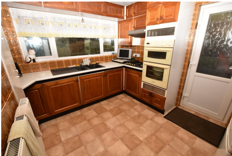
Kitchen 11'10 x 10 (3.61m x 3.05m)

UPVC window to rear, UPVC half glazed door to side, Fitted with older range of wooden base and wall cupboards, inset one and a half bowl sink unit with mixer tap, fully tiled walls, Ideal Mexico floor standing gas boiler, Gas hob and electric oven, built in broom cupboard. Airing cupboard housing foam lagged cylinder.