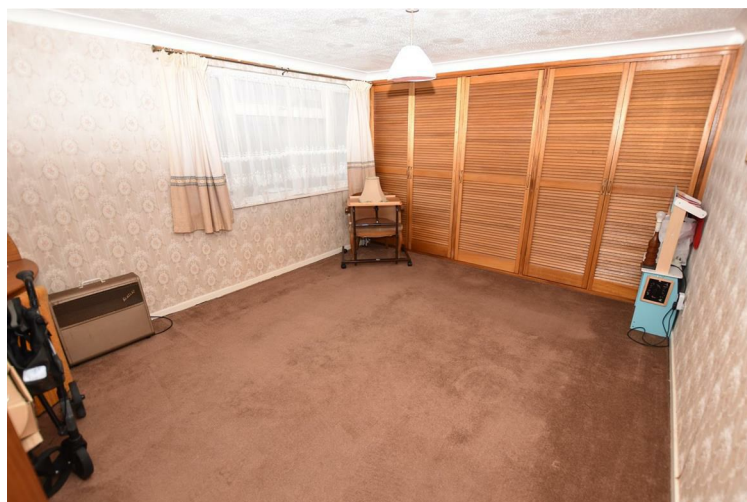
Bedroom One 15'7 x 11'3 inc wardrobes (4.75m x 3.43m inc wardrobes)

UPVC window to front, built in wardrobes to one wall, radiator, coved and artex ceiling.