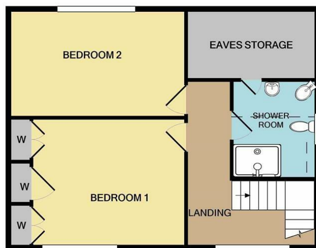
1ST FLOOR APPROX. FLOOR AREA 557 SQ.FT. (51.8 SQ.M.)

TOTAL APPROX. FLOOR AREA 1378 SQ.FT. (128.0 SQ.M.)