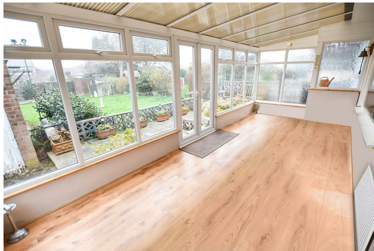
Conservatory 21 x 8'6 (6.40m x 2.59m)

UPVC Double glazed windows and doors to rear, radiator.