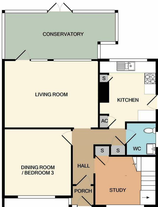
GROUND FLOOR APPROX. FLOOR AREA 821 SQ.FT. (76.2 SQ.M.)