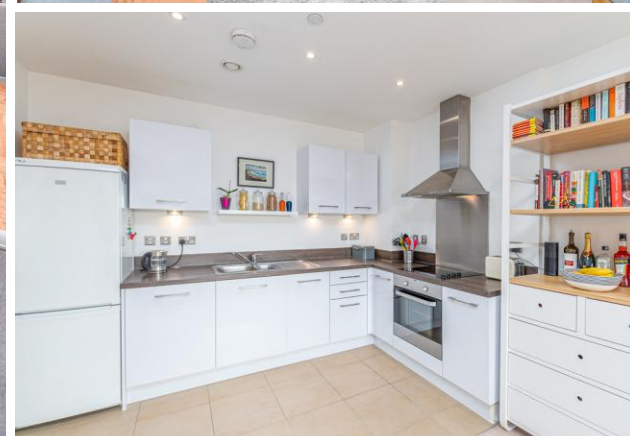
Flotilla House, Battersea Reach, SW18 One Bedroom Apartment

MARTIN&CO Chelsea • Battersea • Riverside