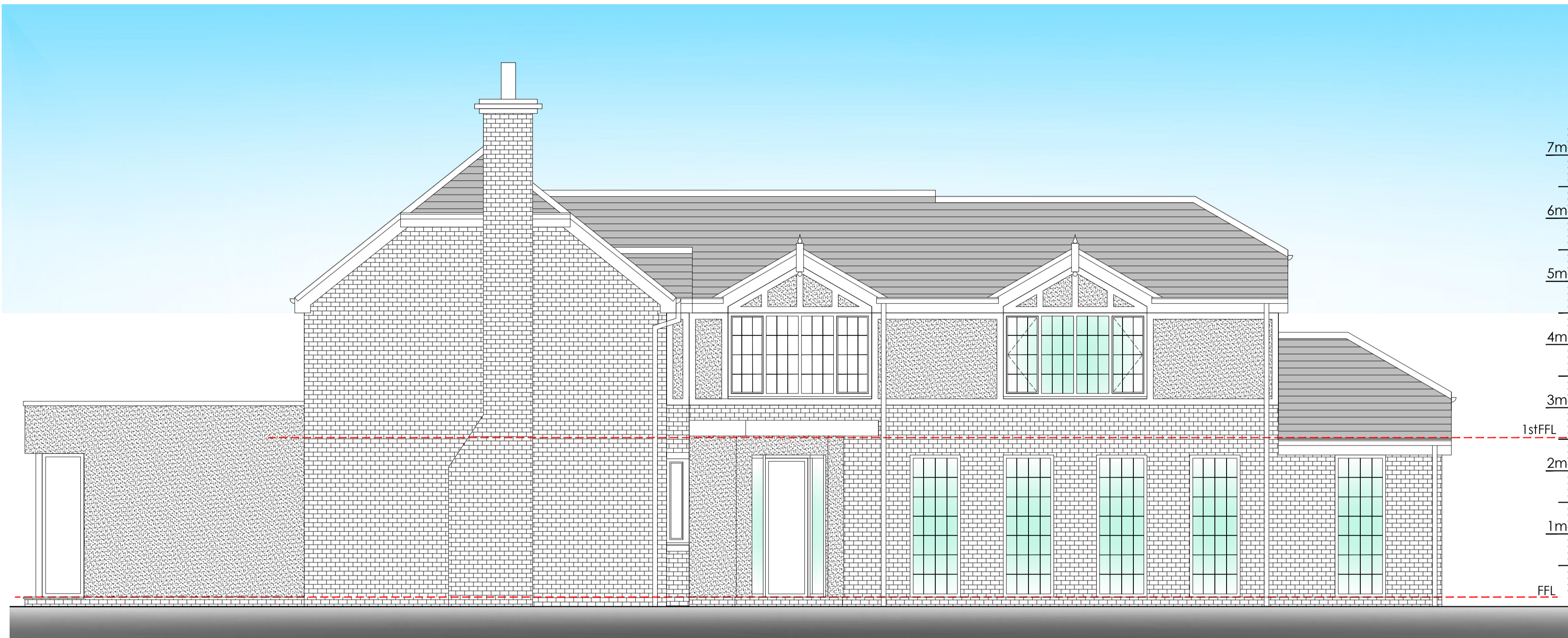
side elevation - as proposed scale 1:50 @ A1

The Copyright of a drawing belongs to P.J.H. Architectural Services Ltd and shall not be used or reproduced in any form without its express permission. Do not scale from this drawing - Work to figured dimensions only. All dimensions to be checked on site prior to the commencement of any work. For the avoidance of doubt all dimensions are measured to wall structure and not the internal/external finishes unless otherwise stated. Where any discrepancy is found to exist within or between drawings and/or documents and site, it should be reported to the client and P.J.H. Architectural Services Ltd immediately. P.J.H. Architectural Services Ltd shall not be liable for any use of drawings and documents for any purpose other than for which the same were prepared by or on behalf of P.J.H. Architectural Services Ltd. Drawing to be read in strict conjunction with structural engineers details. Note, with regards to structural elements and details these take precedence over the information shown on this drawing. Please send any corrections and discrepancies to: enquiry@pjhas.co.uk Please note, in some circumstances, whilst some 2d designs can show elements of design, that it is hard to actually know 100% of the detail until works are on site! It is the contractors responsibility to construct works on site in agreement directly with the client