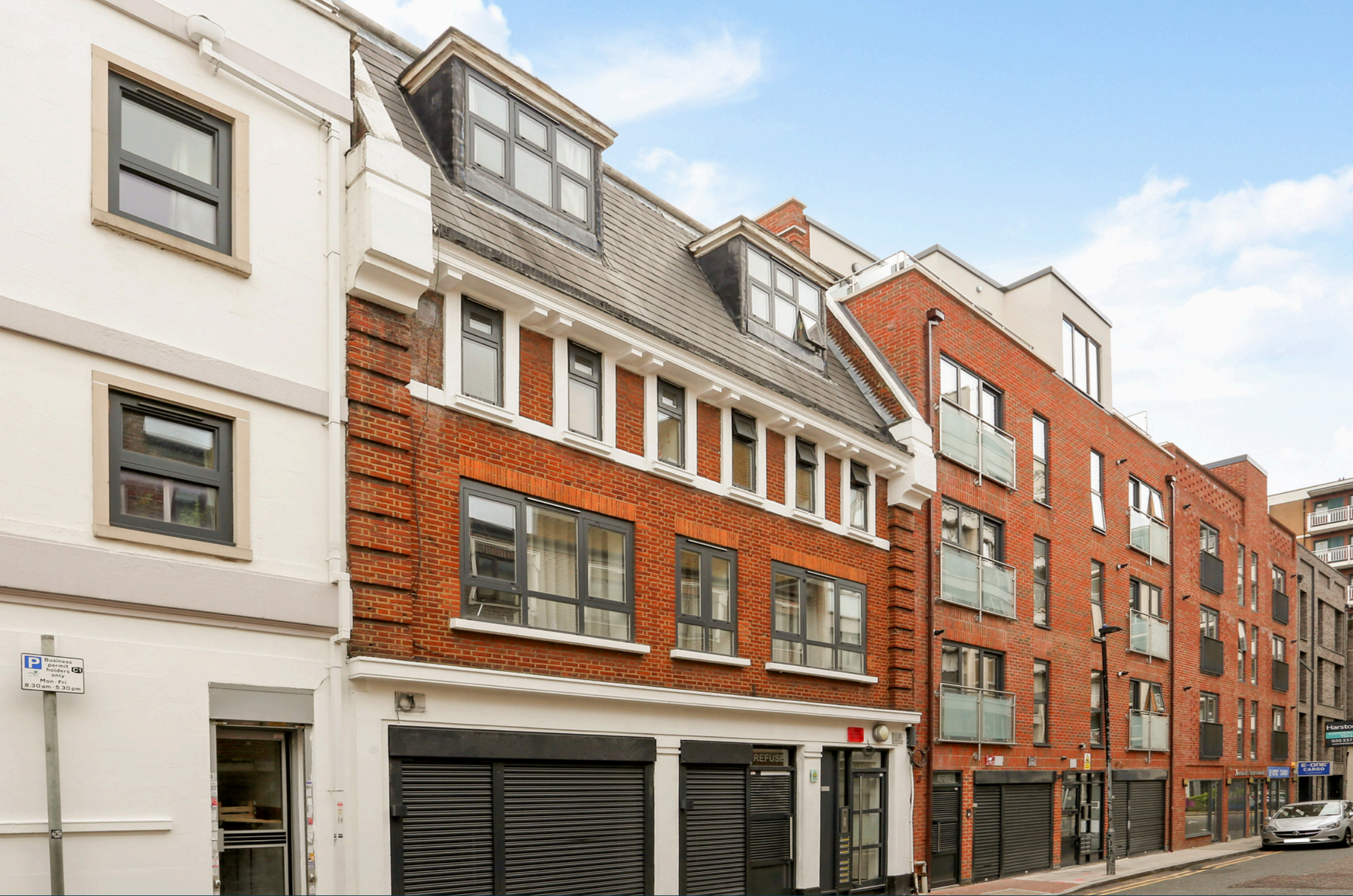
Jacob Mansions, 3 Umberston Street, London, E1 1PZ