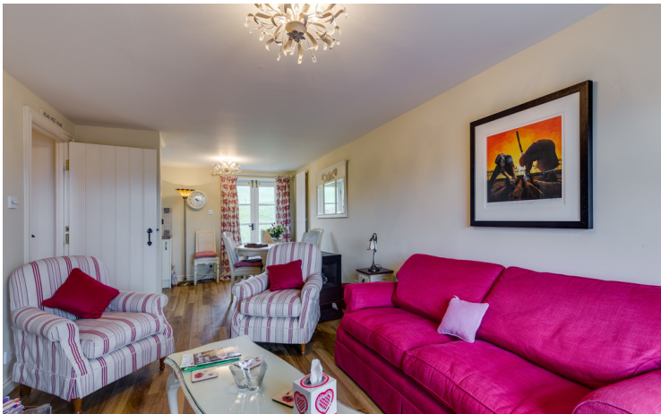
Open Plan Living Room

Description: This attractive three bedroom home is situated in a very special development of individual homes that have been created with thought, care and imagination on the outskirts of The Market Town of Kendal. The accommodation is both well presented and thoughtfully laid out over three floors. On the ground floor is the entrance hall and two double bedrooms and the house bathroom, with the first floor open plan living room and kitchen taking full advantage of the splendid countryside and fells views and having double doors that open to a decked walkway across to the private enclosed garden. On the second floor is a superb bedroom and separate shower room. To complete the picture are well tended easy to manage gardens and a garage situated in a block with a parking space to the front of the garage. A home ideal for permanent living or as a second home on the fringe of the Lake District National Park. There is to be no upward chain and early possession is available.