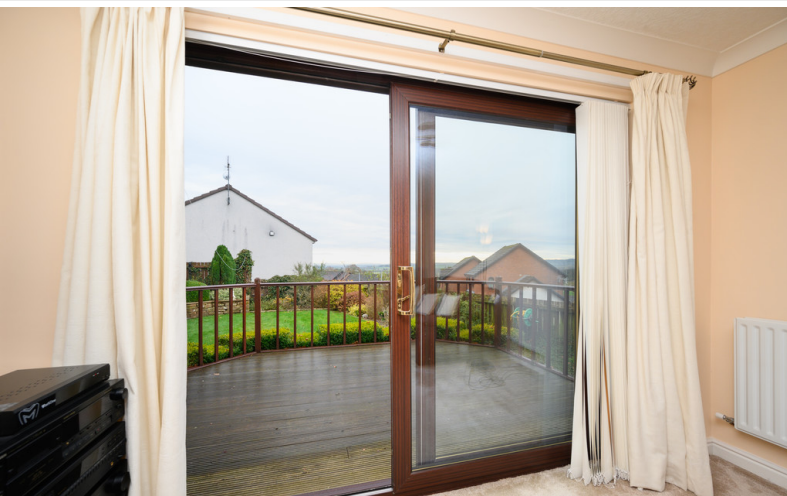
Access to Balcony