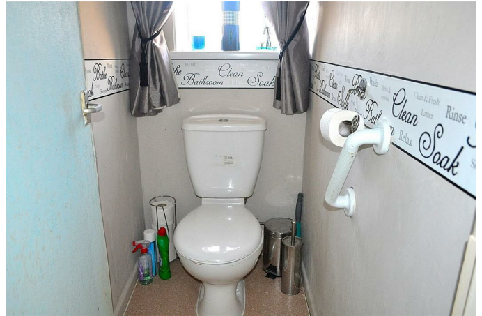
Double glazed frosted window to side, low level w/c.