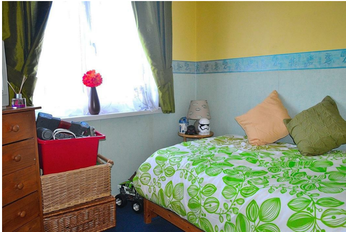
Double glazed window to front.