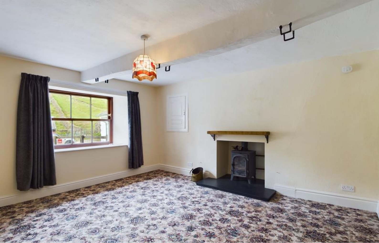
Lounge with Burner