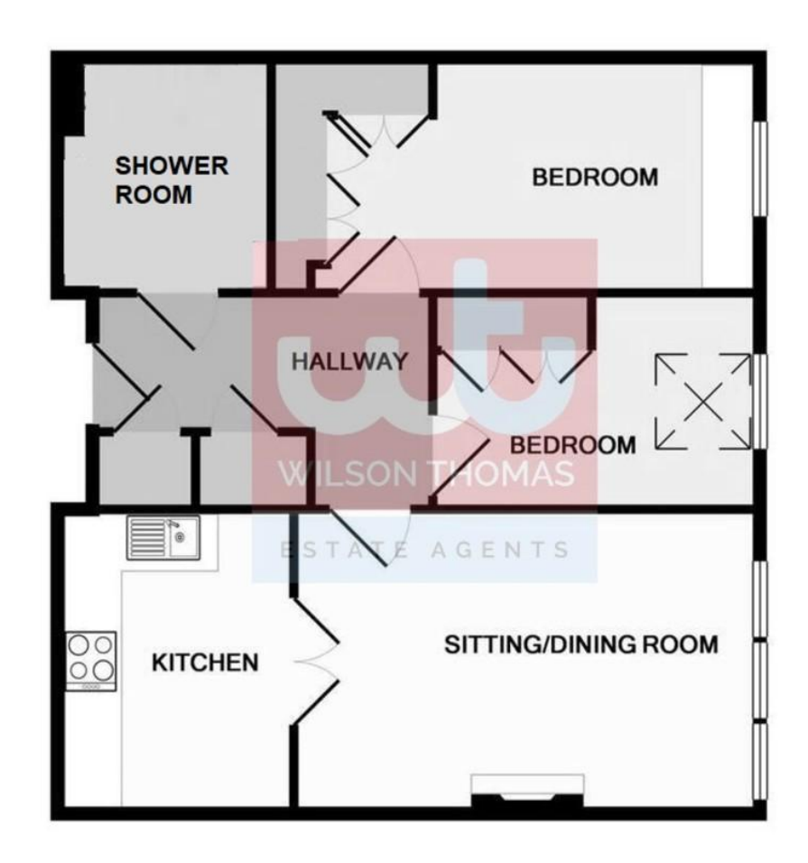
This Floor Plan is for guidance only and is NOT to SCALE Made with Metropix ©2017