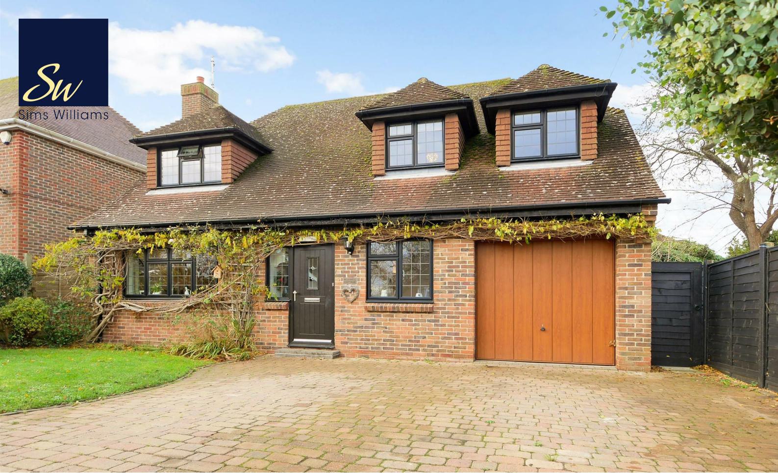
BLUEBELL COTTAGE, CLOVELLY AVENUE, FELPHAM, SUSSEX, PO22 8QN