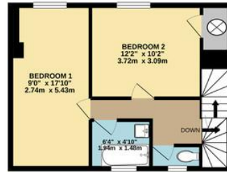
1ST FLOOR 413 sq.ft. (38.4 sq.m.) approx.