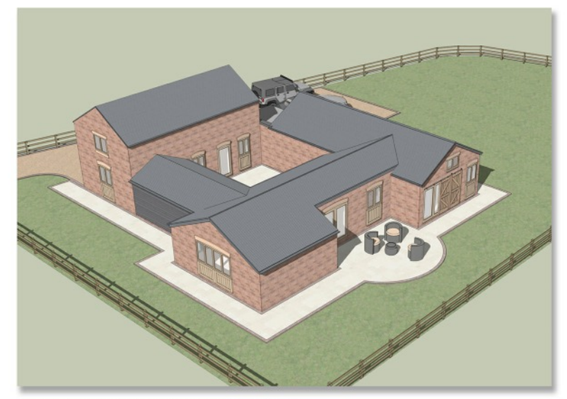
PROPOSED ARTIST IMPRESSION