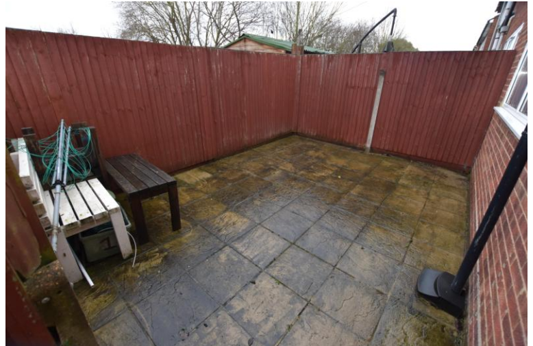
Garden Close, UB5 5ND

Leasehold - 79 Year Lease (as advised) Ground Rent £50 per annum Council Tax Band C £1,397