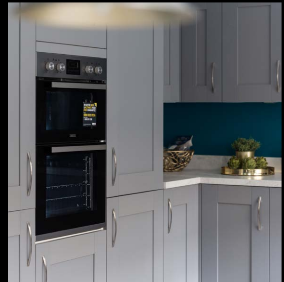
An integrated double Zanussi oven comes as standard in the Excellence Collection.