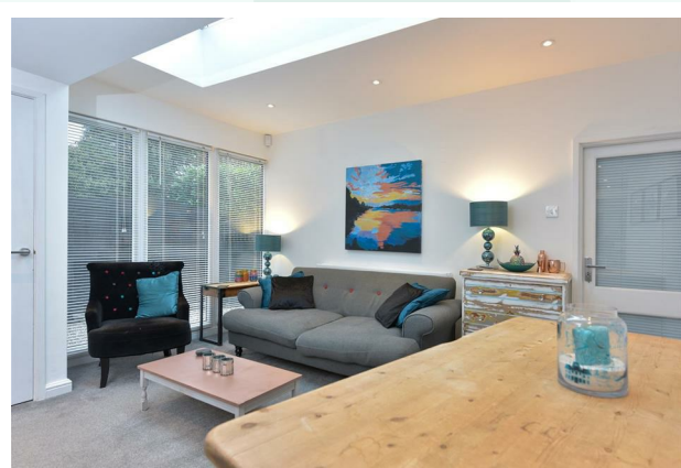
Open Plan Kitchen/Diner/Family