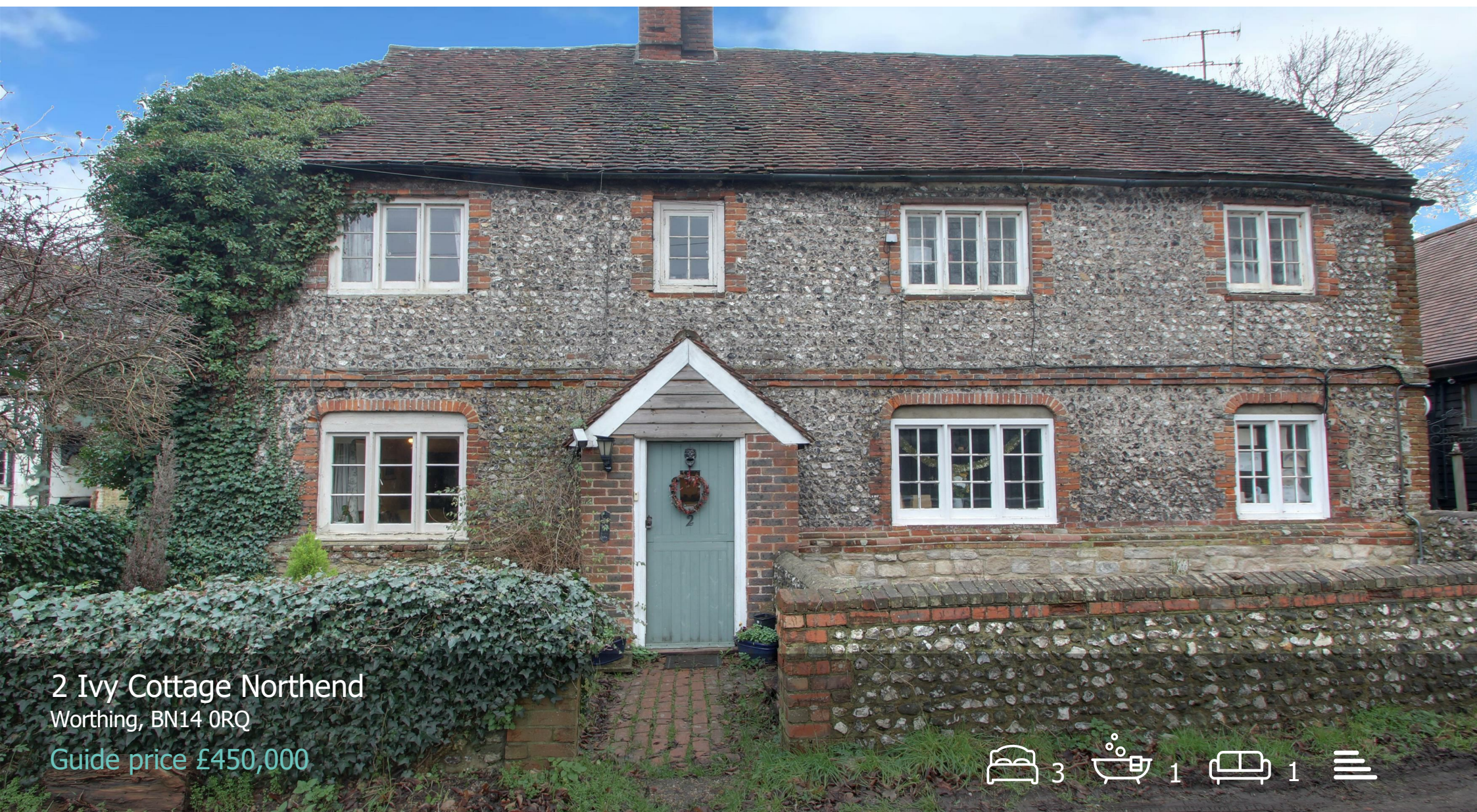
2 Ivy Cottage Northend