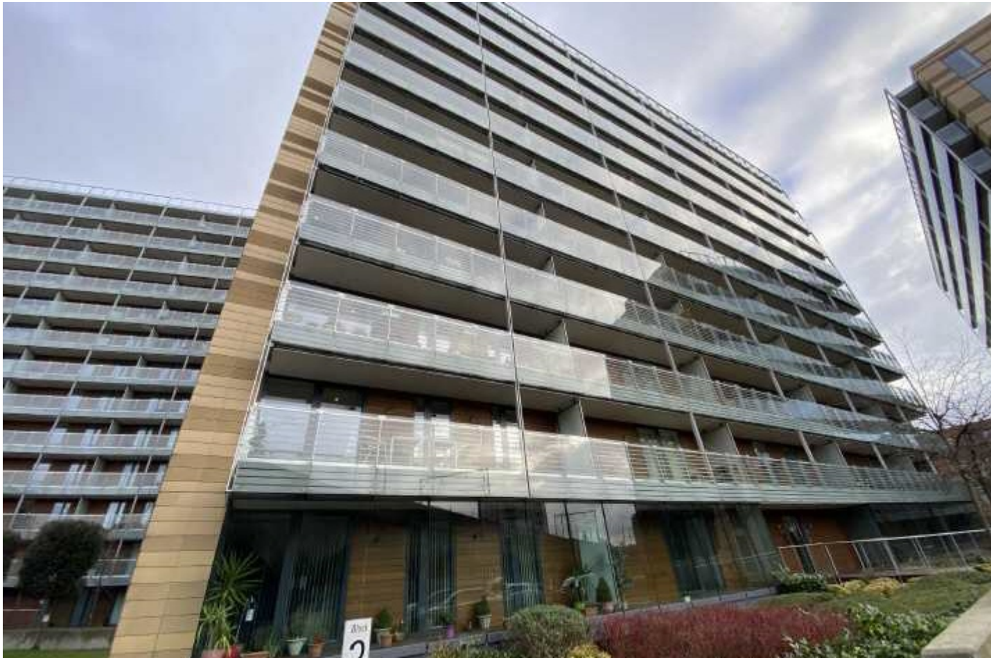
St Georges Island, Castlefield M15 4GS Price £185,000