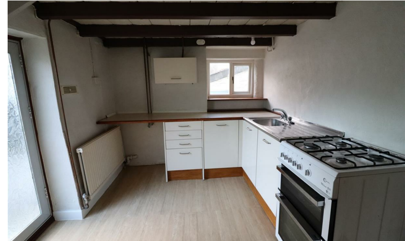
OLD HILL, GRAMPOUND £700 PCM