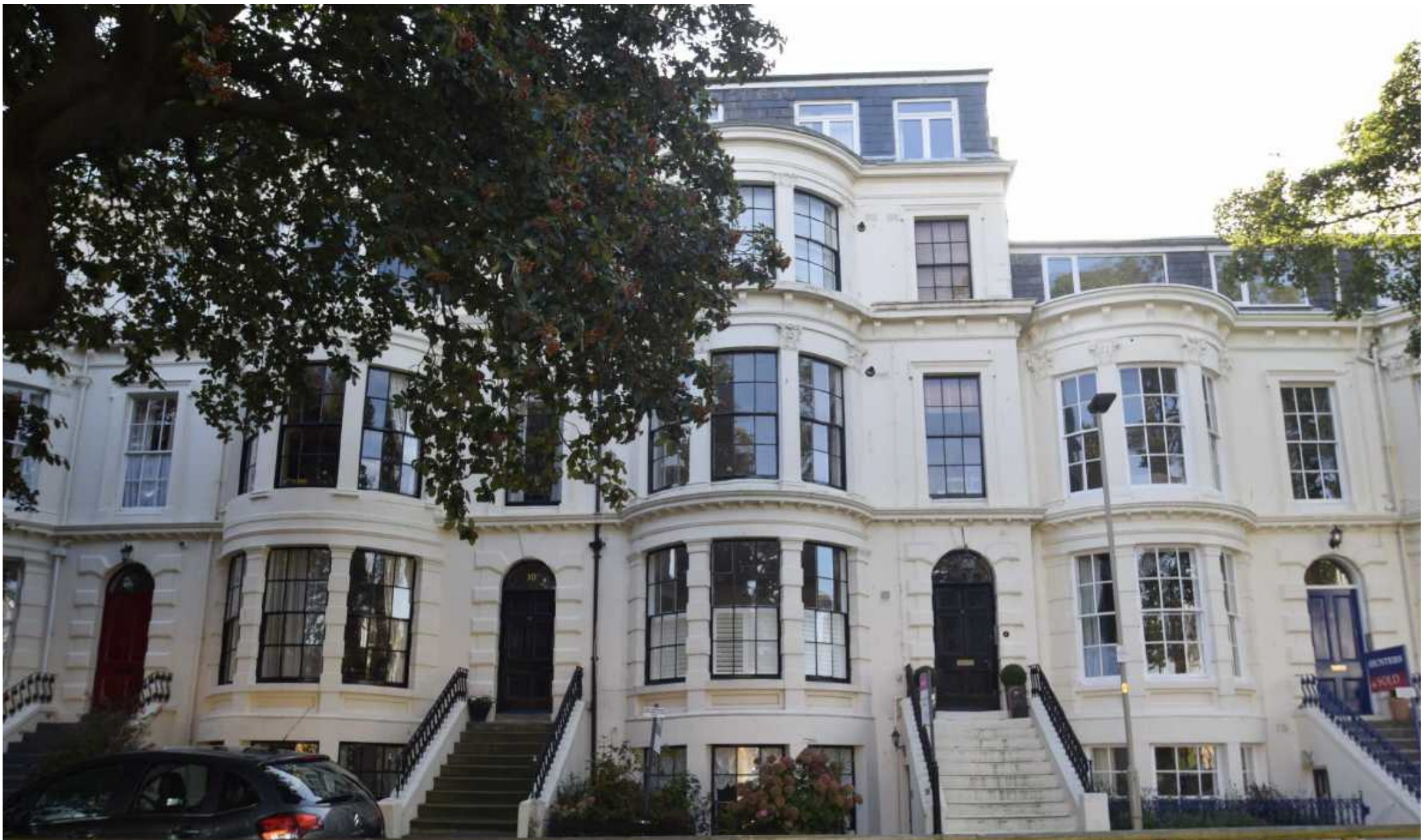
Flat 1, 11 Crown Terrace Scarborough YO11 2BL