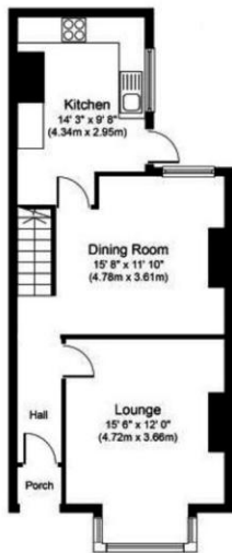
Ground Floor Approximate Floor Area 485 sq. ft. (45.0 sq. m)