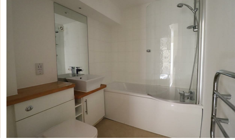
WHYM KIBBAL COURT, REDRUTH £695 PCM