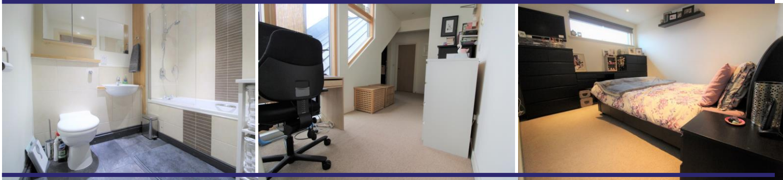
3RD FLOOR 493 sq.ft. (45.8 sq.m.) approx.