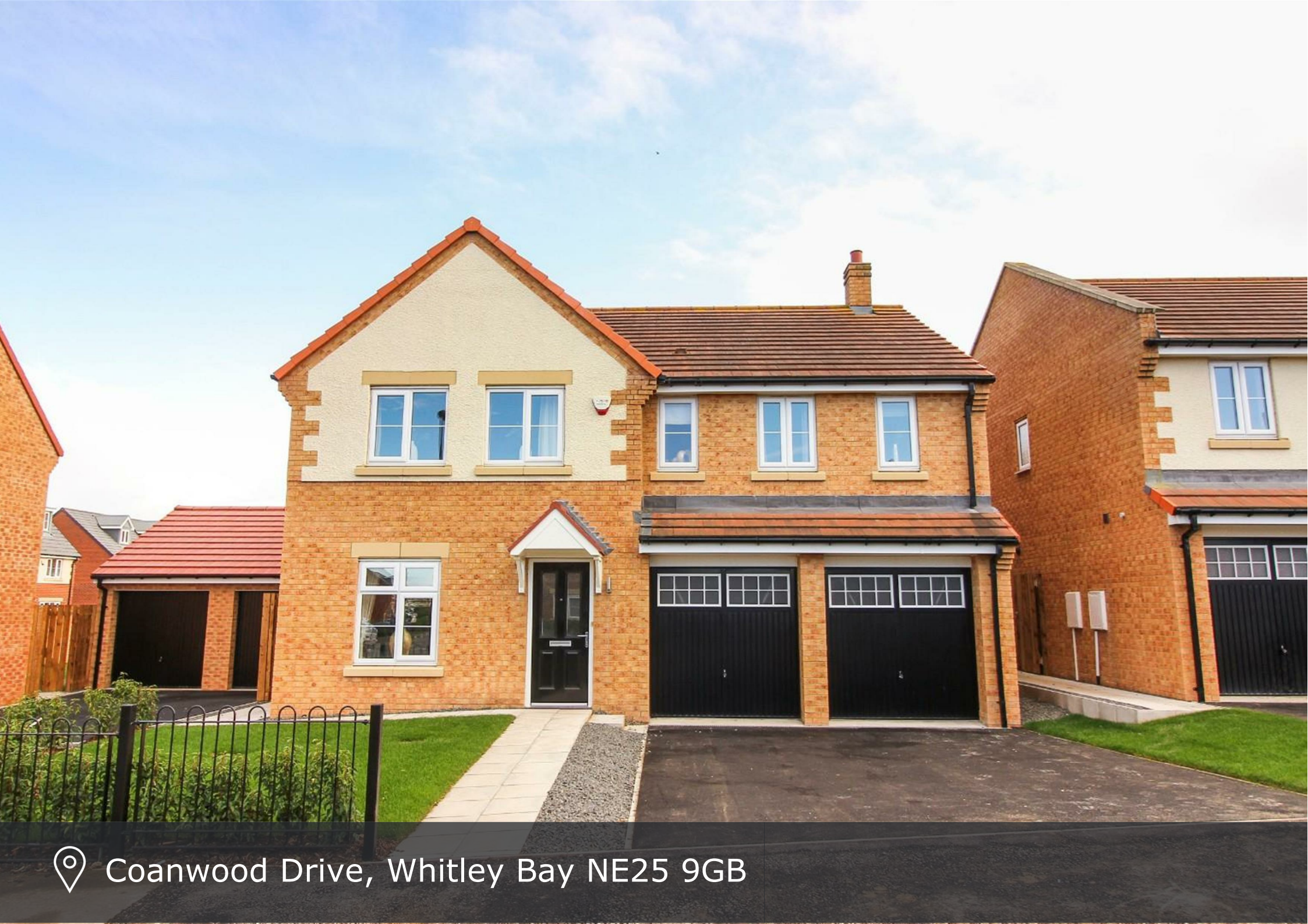
📍 Coanwood Drive, Whitley Bay NE25 9GB