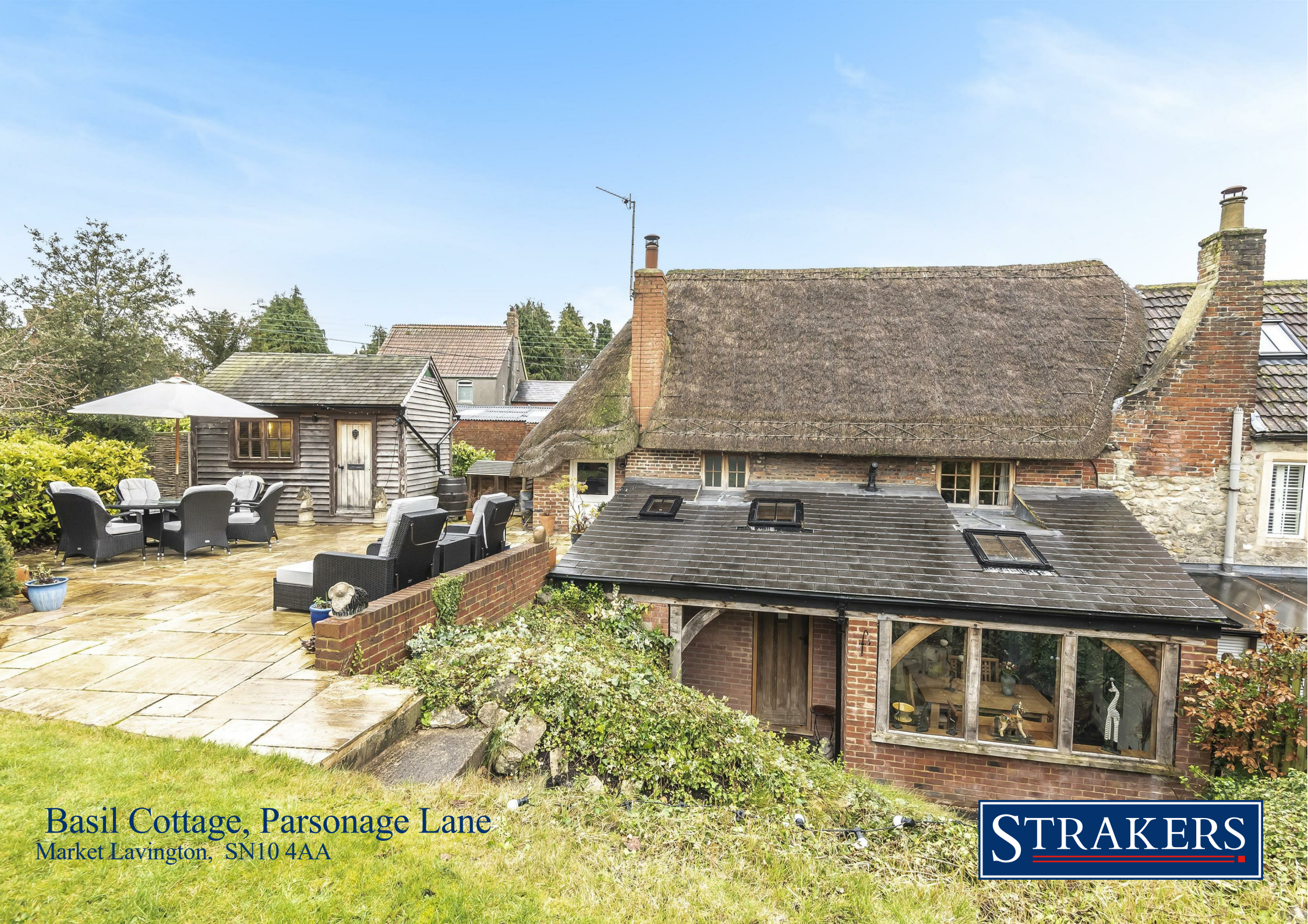
Basil Cottage, Parsonage Lane Market Lavington, SN10 4AA