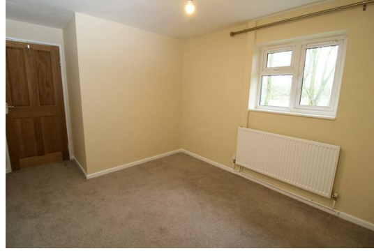
Bedroom Two 9'11" x 8'8"