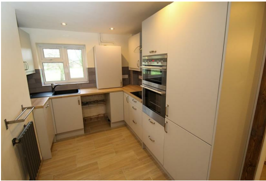
Kitchen 6'7" x 12'4"