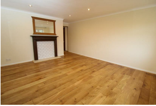
Lounge/Dining Room 14'3" x 12'4"