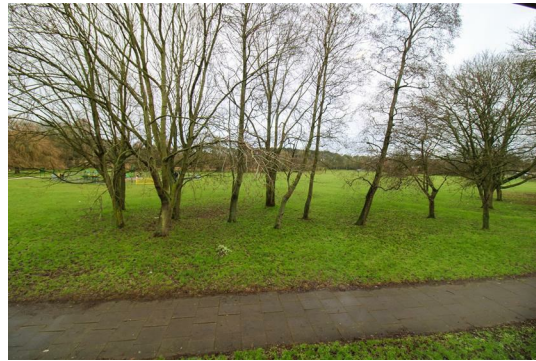
Views From the Property