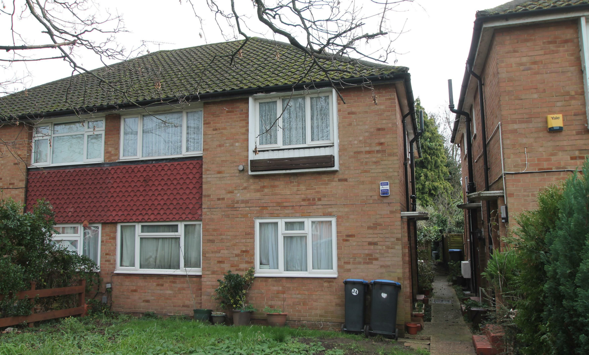
Hazelwood House, New River Crescent, London, N13 Chain Free £335,000 Leasehold