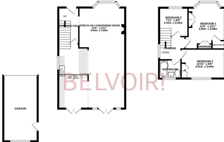
TOTAL FLOOR AREA : 1173 sq.ft. (109.0 sq.m.) approx. Made with Metropix ©2021

These particulars are intended as a guide and act as information only. They give a fair overall description for the guidance of potential purchasers, but do not constitute an offer or part of a contract. All details and approximate measurements are given in good faith and are believed to be correct at the time of printing