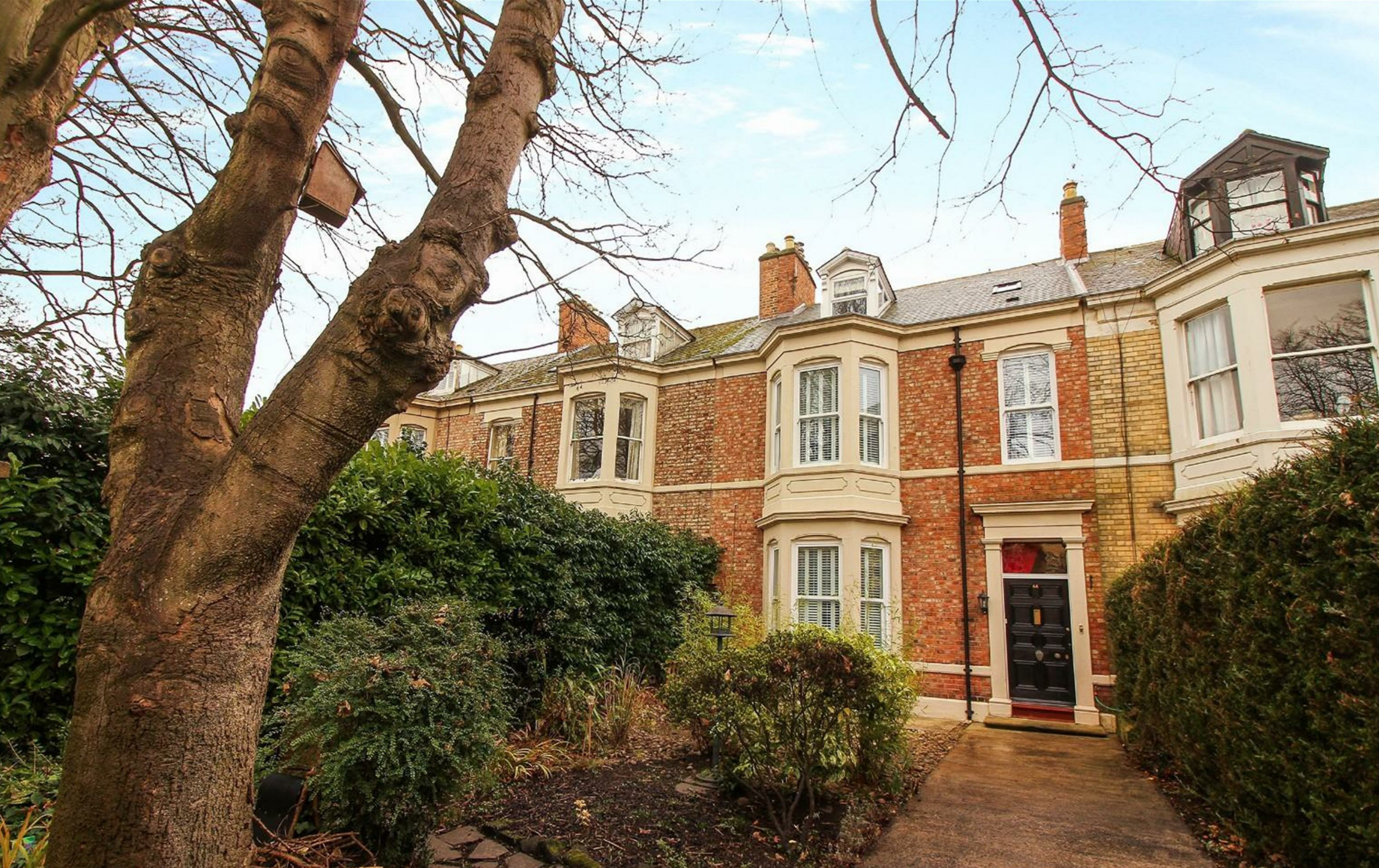
📍 Alma Place, North Shields NE29 0LY