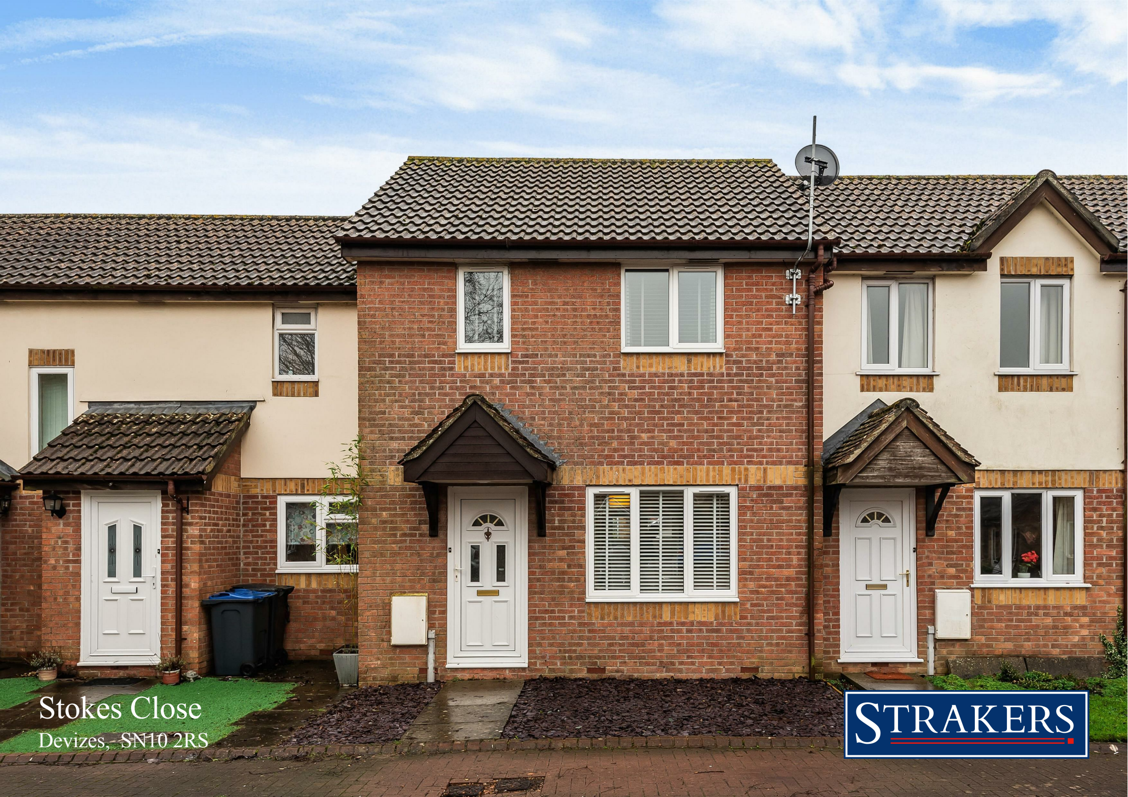
Stokes Close Devizes, SN10 2RS