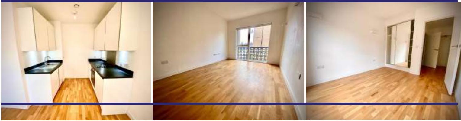
GROUND FLOOR 382 sq.ft. (35.5 sq.m.) approx.