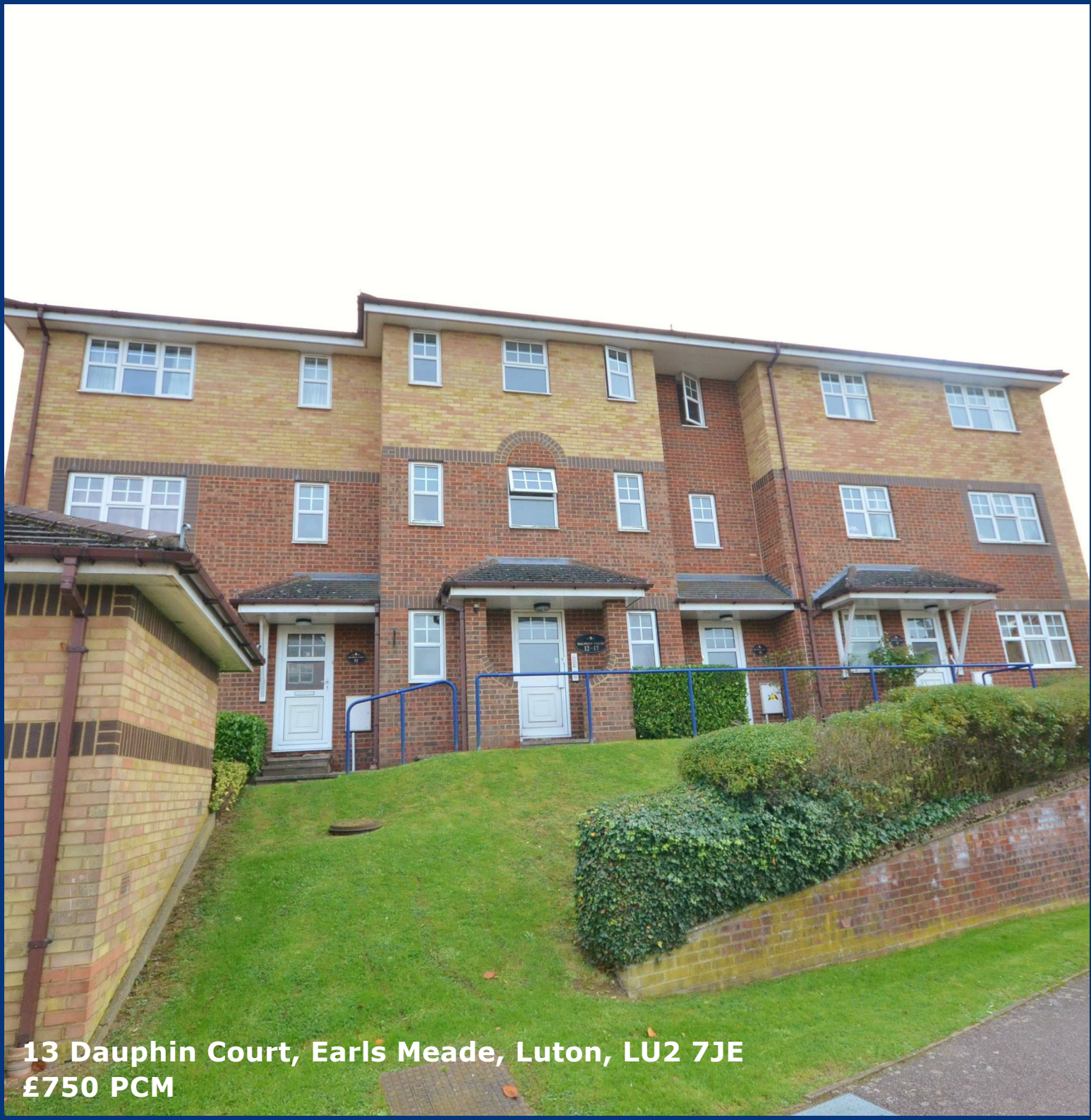
13 Dauphin Court, Earls Meade, Luton, LU2 7JE £750 PCM