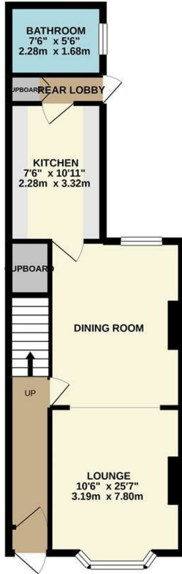
GROUND FLOOR 477 sq.ft. (44.3 sq.m.) approx.