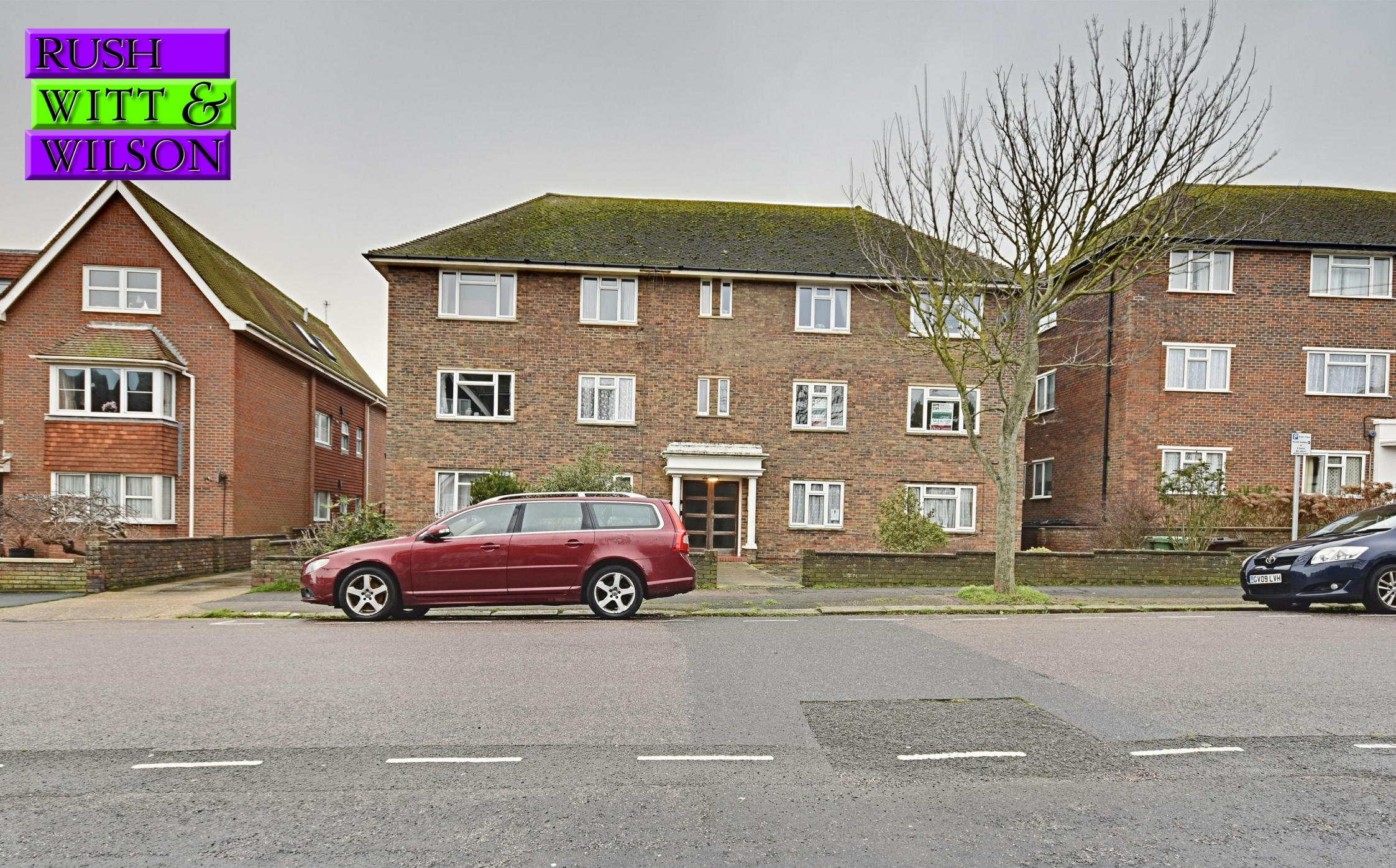
Newlyn Court Brassey Road, Bexhill-On-Sea, East Sussex TN40 1LE £235,000