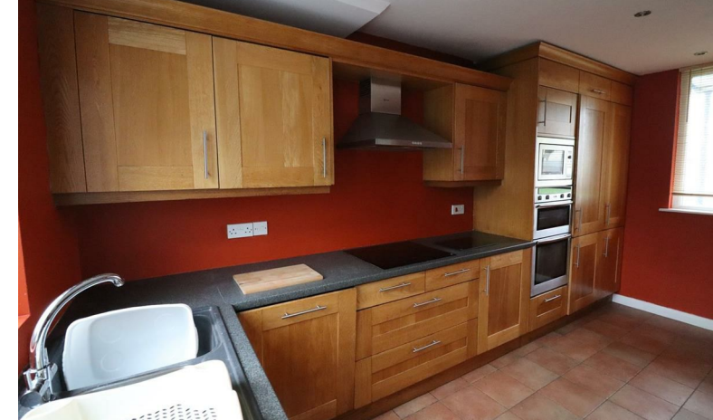
NORTHFIELD DRIVE, TRURO £775 PCM