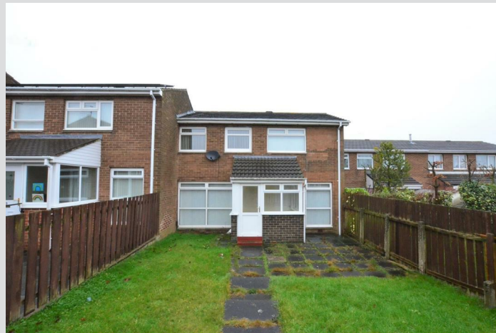
A lawned garden to the front with gated access. Rear lawned garden with mature shrubs with a driveway and garage providing off street parking.