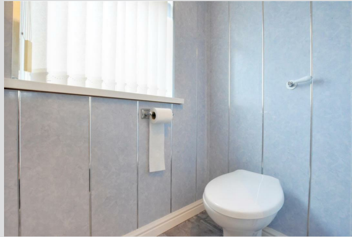
Low level WC, UPVC window to rear.