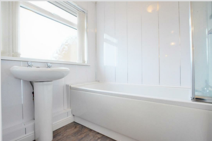
Pedestal basin, bath with overhead shower, UPVC window to rear.