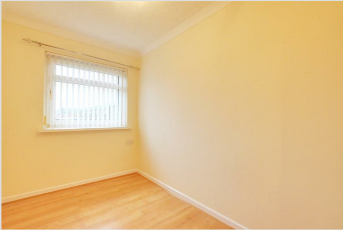
UPVC window to front, laminate flooring, single radiator.