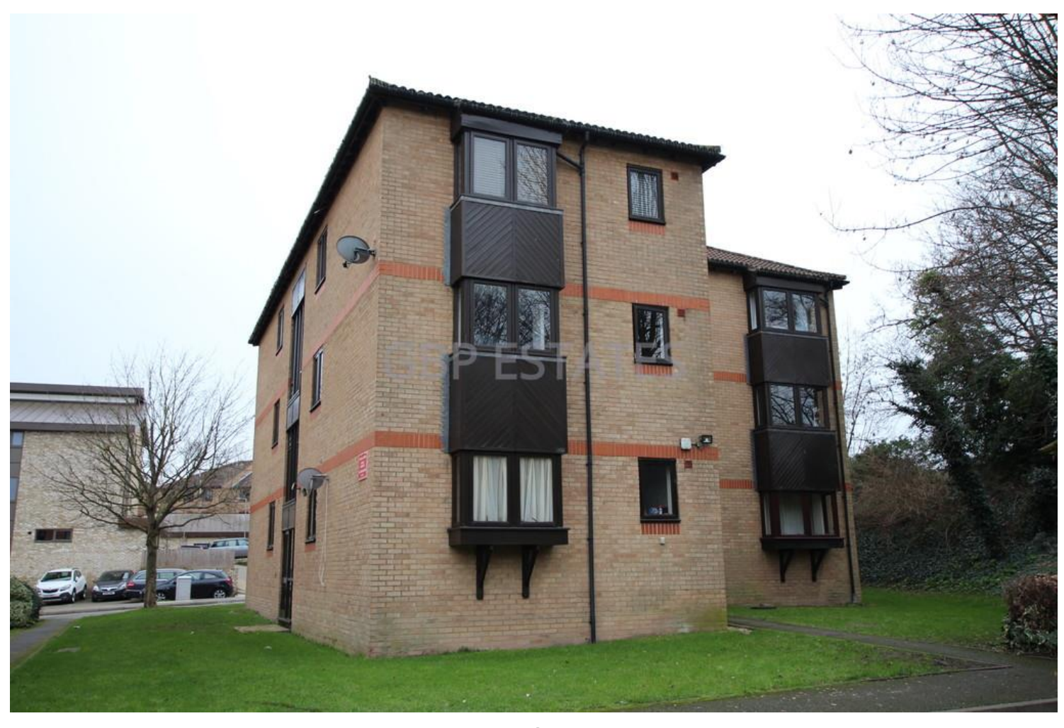
Rushdon Close, Romford

Email: lettings@gbpestates.co.uk Website: www.gbpestates.co.uk