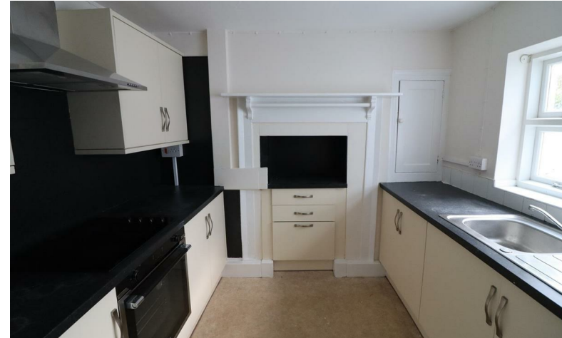
ST.JOHNS TERRACE, DEVORAN £1,100 PCM